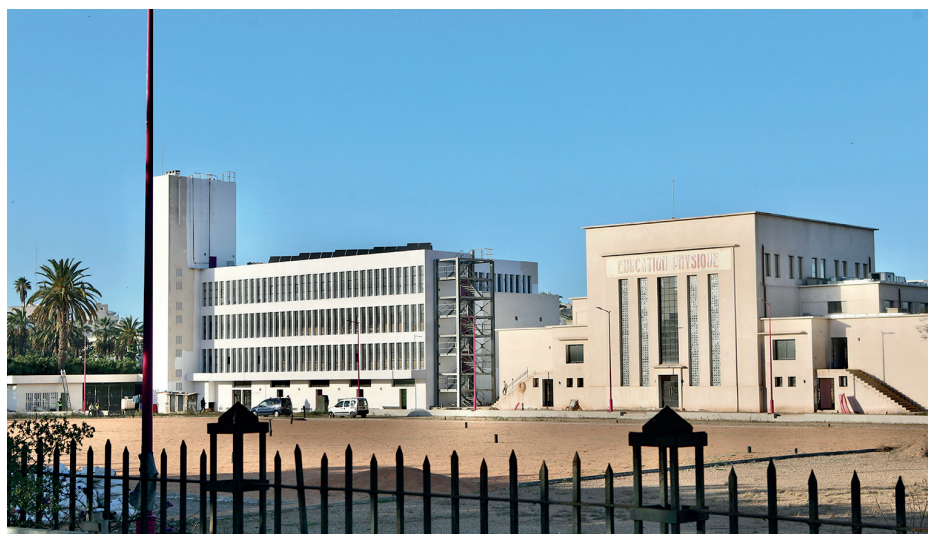
Following the rehabilitation of the Arab League Park and its adjoining squares (Mohammed V and Nevada), it is La Casablancaise's turn to open its doors to sports enthusiasts

Today, the municipality has officially entrusted the management and operation of the site to the National Stadium Construction and Management Company (Société nationale de réalisation et de gestion des stades - Sonarges). Under the terms of the agreement, adopted during the recent May session of the city council, the Sonarges company will manage the facility for a renewable 5-year period. Prior to this, however, the ministry in charge of the project will have to carry out site development