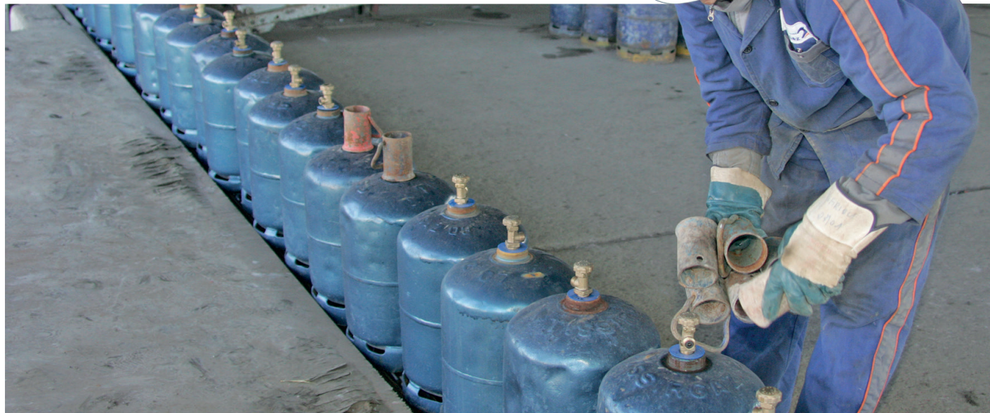
In addition to improving purchasing power and incomes, other major issues are on the negotiating table: the draft organic law on pensions and pension reform

Eventually, will true prices be applied, or will prices be capped? The Ministry of Finance was due to answer this question during the question time session in Parliament on Monday May 20 ... During discussions relating to the Finance Act, Fouzi Lakjaa, Minister of the Budget, had mentioned a "price cap", without providing further details concerning the desired level. In preparation for this removal of butane