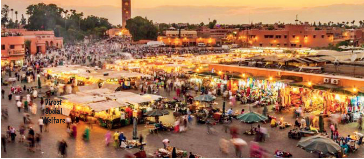
Tourism in Marrakech: It has to be said that tourism in the red city is no longer seasonal. With the last minutes, the month of March could end with a

In any case, the month of March, modest though it was, foreshadows a promising month of April. Indeed, the spring vacations, particularly in France, start in zone A on April 13, almost coinciding with Semana Santa in Spain. In the meantime, Marrakech's hotels remain active, welcoming streams of tourists in March, with a high proportion of last-minute bookings, sometimes accounting for up to 20% of arrivals in the city. However, Marrakech's tourism industry is struggling to make Ramadan an attractive time of year. Demand for local tourism, Marrakech's main market, remains very modest. Domestic travelers, traditionally a crucial sup-