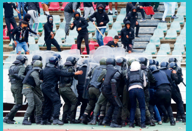
Violence in stadiums Tougher anti-violence measures