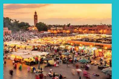
Ramadan has no impact on tourism in Marrakech