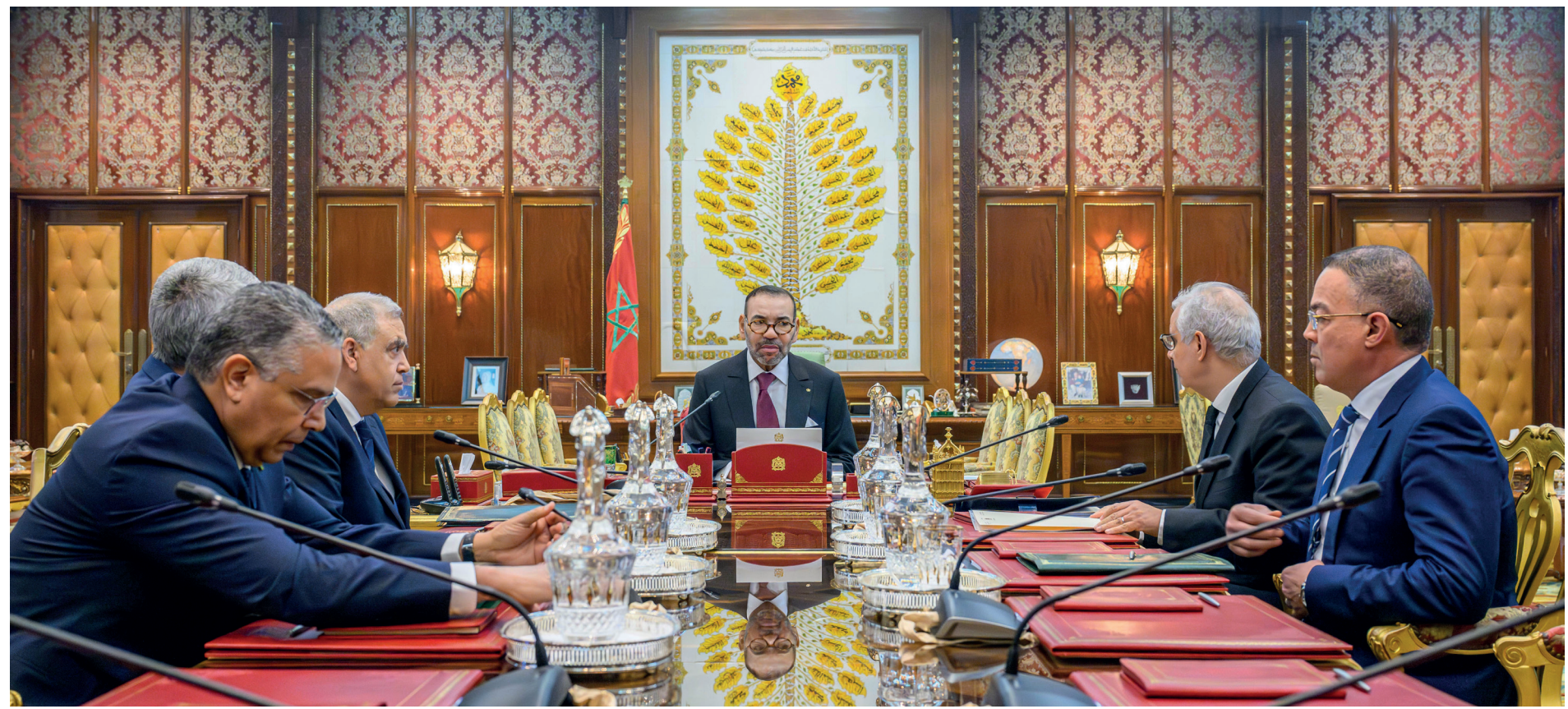
During the meeting devoted to water issues, the Sovereign recommended that the departments and organizations concerned double their vigilance and efforts to meet the challenge of water security and ensure drinking water supplies throughout the country

co is not out of the woods yet. After his address before the Parliament at the opening of the autumn session and a meeting devoted to water issues, HM the King was back at it again with another working session on Tuesday in Rabat. Clearly, the aim is to review the progress of the various projects under the 2020-2027 National Drinking Water Supply and Irrigation Program. The same goes for the part relating to emergency measures. In any case, the figures provided by Nizar Baraka are alarming and suggest that our country is heading straight for another 6th year of drought. For the period from September to mid-January 2024, Morocco recorded a rainfall deficit of 70% compared with the emergency plan presented to the