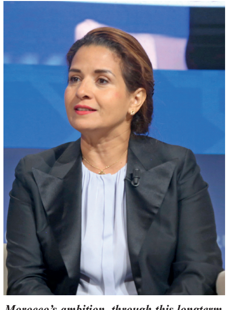
Morocco's ambition, through this longterm low-carbon roadmap, is to develop new green value chains, and improve the competitiveness of its economy, while ensuring its decarbonization and proactive export positioning

On this occasion, the Minister emphacarbon roadmap, Morocco's ambition sized that through this longterm low- is to develop new green value chains,