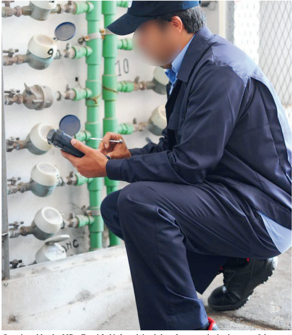
Questioned by the MPs, Fouzi Lekjaâ explained that, for example, in the case of the increase in VAT on electricity and meter rental of 2% and 4% per year over the next three years, this measure will only increase the weighted average monthly bill by 2 MAD in 2024, 4 MAD in 2025 and 6 MAD in 2026 compared with 2023.

The second social bracket accounts for 17% of bills. Families in this category will pay 2.3 Dirhams more on their bill over the year. Thus, the 83% increase in bills due to the VAT rate will not exceed 3 Dirhams per month over the 2024-2026 period. As for the selective billing category, it concerns those who consume more than 500 kw/h per month, which exceeds the electrical energy consumption of 5 families in the first social bracket. Families in this category will see their monthly bill increase by 20 Dirhams per year; that is to say 20 Dirhams in 2024, 40 Dirhams in 2025; and 60 Dirhams in 2026.