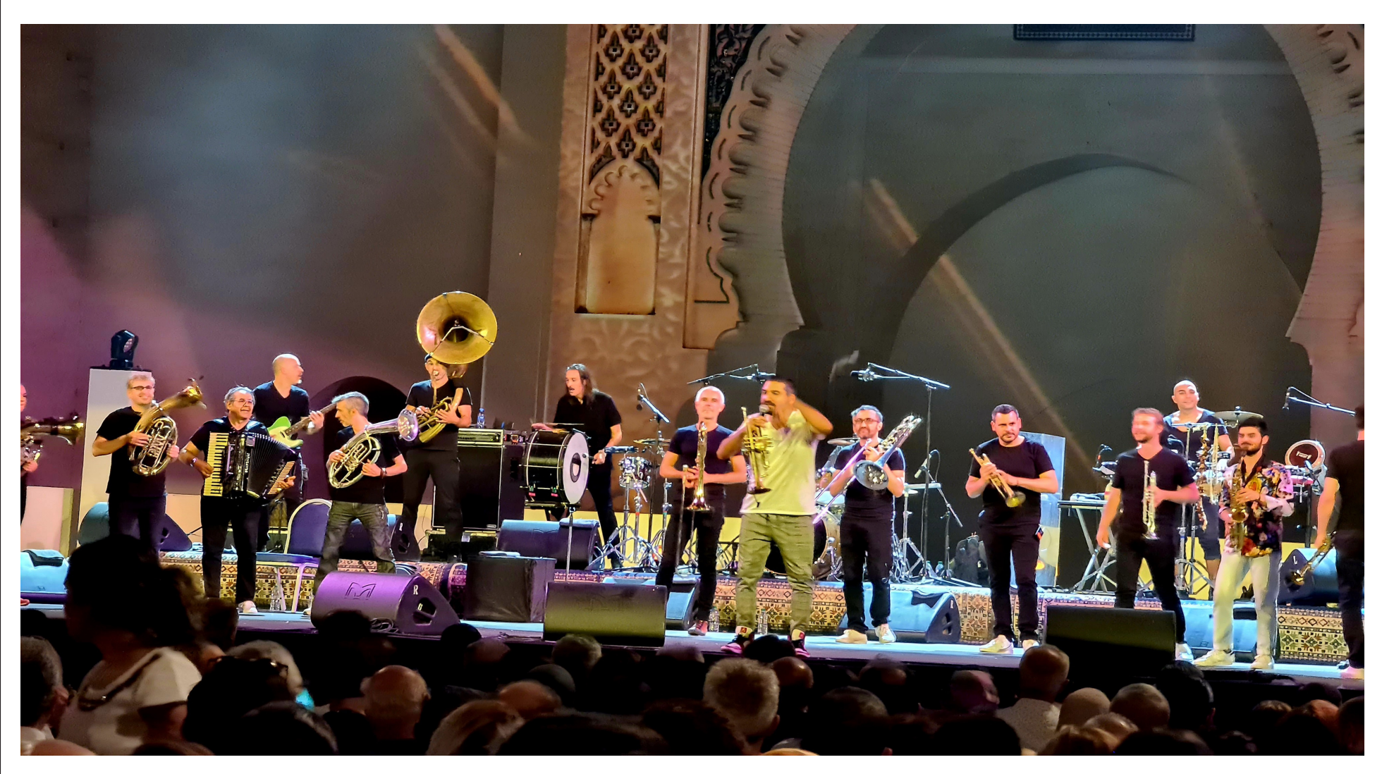
Artists from Uzbekistan, Iran, Syria, India, Spain, Egypt, Italy, Armenia, France, and Morocco will set the Bab El Makina stage alight for the 27th edition of the Festival of World Sacred Music, scheduled for September 15-23, 2023

HE spiritual capital's flagship event is already in its 27th year. The Fez Festival of World Sacred Music (FFMSM) will kick off the cultural season. Scheduled to run from September 15 to 23, 2023, the new edition promises a return to the event's original format. This follows the cancellation of the 2020 and 2021 editions due to health constraints caused by Covid-19, and a four-day edition in 2022.