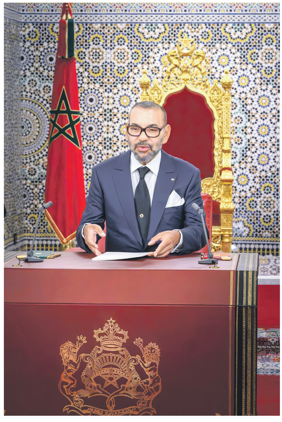
«Given the disruptions affecting the global value system and frame of reference, and considering the repercussions of a number of overlapping crises, we really need to commit to seriousness in the original Moroccan acceptation of the term «, in particular «by adhering to religious and national values"

■ Integrated approach: Today, seriousness is the key word for the next period. It must "constantly define our course of action, in everyday life as well as in the workplace". For the Sovereign, this attitude must be rigorous in the various sectors. This concerns in particular the political, administrative, and judicial domains. The idea is that dedication to serving the citizenry should be the norm. This requires the identification of highly qualified people, and by the primacy granted to the interest of the Nation and of the citizens. To achieve this, it is equally important to break with oneupmanship and narrow calculations. It is an integrated approach that subordinates the exercise of responsibility to the requirement of accountability. This approach is based on the values of work, merit, and equal opportunity. The major strategic projects for the generalization of social protection, the upgrading of the health system, the reform of education, the fight against unemployment, and other projects, cannot be effective if seriousness is not required. The business community was also challenged and urged to act differently. "The seriousness that we advocate must prevail among the business community, in the fields of invest-