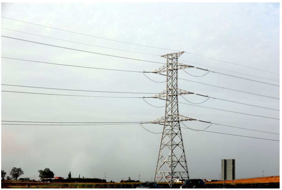
ONEE (National Office for Electricity and Drinking Water) and the utilities will be relieved of distribution for the benefit of regional multiservice corporations

Adopted by 154 votes in favor, 21 against, and 16 abstentions, Law No. 83.21 on the creation of regional