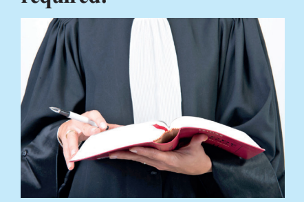
Courts: Proper attire required!