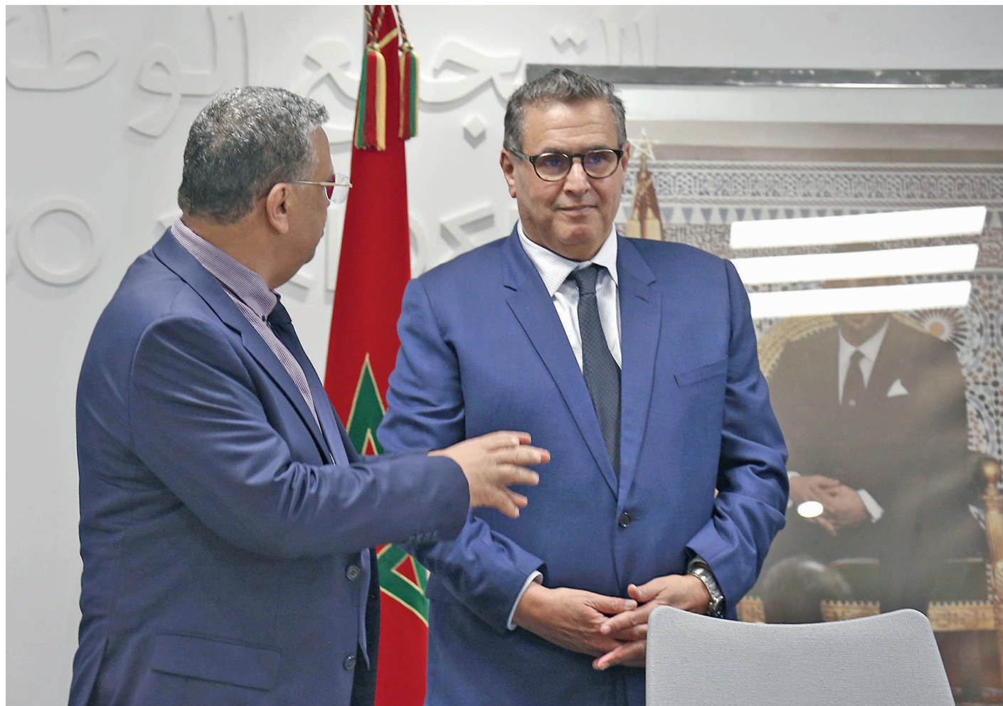
The political bureau of the PAM made a thunderous public statement, insisting on "the importance of internal communication between members of the Government to speed up the implementation of reform projects". As such, PAM "invites the Head of Government to ensure that effective internal communication with the ministers is intensified"

No matter, today, they are overtaken by the harsh reality. Thus, the political bureau of the PAM made a thunderous public statement. According to the press release, released after its meeting last Wednesday, the political bureau stresses the importance of deepening external communication between the government and citizens, and intensive communication of all ministers with the public opinion in order to curb rumors and fake news. It is also about enabling citizens to enjoy their right to information. In the same vein, the political bureau emphasizes "the importance of internal communication between members of the Government to accelerate the implementation of reform projects". As such, the political bureau of the PAM "invites the Head of Government to ensure that effective internal communication with our ministers is intensified," the statement read. Before drawing conclusions, it is imperative to set the scene. The political bureau of the PAM is made up of the leaders in addition to several