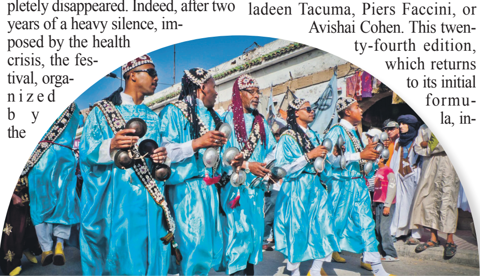
With its traditional opening parade, around forty concerts spread over the various stages and more intimate evenings, the festival returns to its customary version

HE year 2023 seems to be the stage on the beach, the more intimate year of the resumption of a sessions in the zaouïas (Muslim religious building which constitutes the center around which a brotherhood its consequences. So, 2023 will see is structured), the event, which each year attracts some 35 to 40,000 festival-goers from the four corners of the Earth, promises like every year real moments of grace between fusion concerts, intimate evenings, improvised jam sessions, and great debates of ideas. It must be said that despite the crisis, the festival had not completely disappeared. Indeed, after two