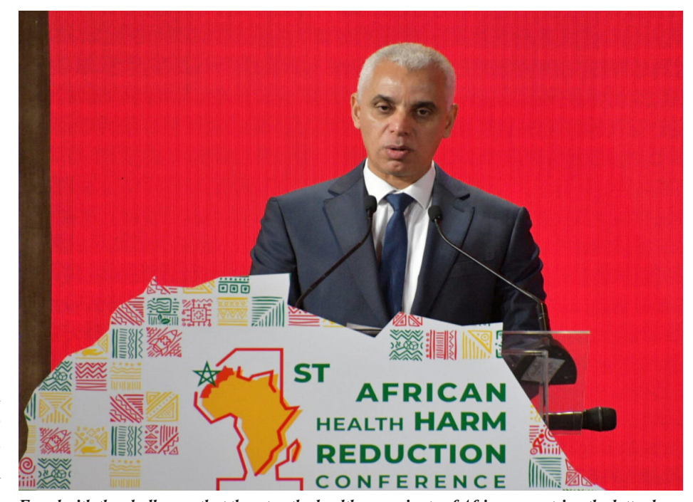
Faced with the challenges that threaten the health sovereignty of African countries, the latter have embarked on a series of profound reforms to limit the divide within the societies of the continent

FRICAN countries made a real commitment during the Marrakech conference on the reduction of health risks, held between November 16 and November 18. Participants in the conference have put in place an action plan contained in a joint declaration published after the end of the event, and declared to be "concerned about the scarcity of resources, poor infrastructure, and low health literacy rates in the Global South, on the one hand, and the stigma, barriers, and reluctance to coope-