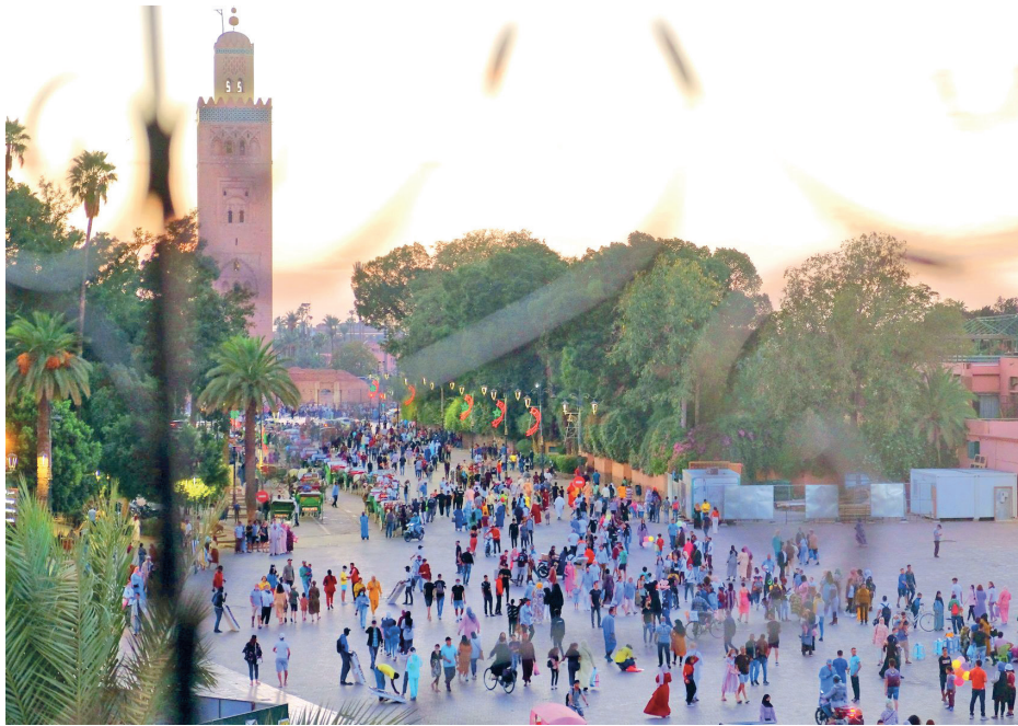
At the end of September, Marrakech recorded nearly 1.3 million arrivals which generated nearly 4 million overnight stays.

As expected, September and October 2022 were exceptional months for tourism in Marrakech thanks in particular to the All Saints' Day but also to the resumption of the events organized in the other city. Conferences, exhibitions, festivals... the agenda is full. These are events that attract both international and national tourists, such as the Marrakech International Film Festival, which has resumed its edition after two years of absence. The hotels rub their hands but shops and bazaars a little less. Nonetheless, the atmosphere of recovery is well and truly established. In terms of figures, at the end of September, Marrakech welcomed nearly 1.3 million tourists according to statistics from the Delegation of the Ministry of Tourism in Marrakech. These arrivals generated nearly four million overnight stays. In the eyes of tourism professionals and in particular hoteliers, the average occupancy rate is the true indicator of the health of tourism in Marrakech. "We hope for even more because the destination deserves it and its players and businesses have shown resilience despite the two-year crisis", said