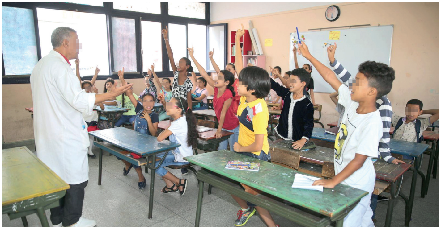
For Chakib Benmoussa, Minister of National Education, this is a long-term reform whose impacts are staggered over time, starting from the 2022-2023 prefiguration, then the inflection during 2024-2025, before arriving at expansion in 2026-2027

“70% of pupils in the public system do not master the program at the end of primary school”. This sentence in the mouth of the Minister of National Education slams like a burst of machine gun fire. And for good reason, the public school does not provide basic learning and arouses the mistrust of citizens. For the schooling of their children, they have chosen schools in the private sector or the foreign schools present in certain cities. In secondary schools, things are no better: on average, 10% of students in the public system do not master the program at the end of the course. With these figures, it is normal for school dropouts to exceed 300,000 students per year, and precisely, Chakib Benmoussa wants to reduce this figure by one third by 2026, i.e. the date of the end of the term of office of this government. In any case, his task is not small. This is why the minister has drawn up a roadmap supposed to rectify the situation which he presented to the Government Council before giving his outline to the press on Thursday 10 November. For Chakib Benmoussa, this is a long-term