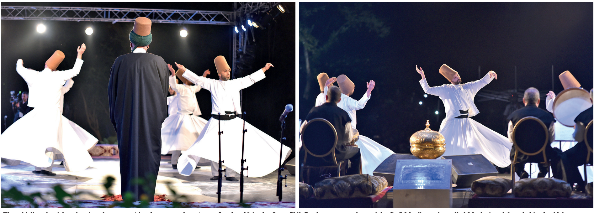
The whirling dervishes dancing the samaa (ritual gyratory dance), on October 28 in the Jnan Sbil Garden, are members of the Sufi Muslim order called Mevlevi and founded in the 13th century by Jalal al-Din Rumi in Konya in the Sultanate of Roum