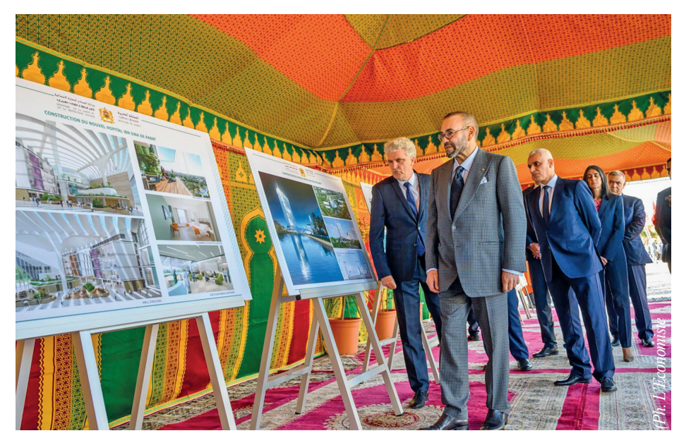
The Sovereign kicked off work on the construction of the new Ibn Sina University Hospital in Rabat on Thursday, May 5. This is a new structure that is part of the gigantic royal project relating to the generalization of social protection

According to its initiators, this project testifies to the special interest that the Sovereign grants to the health sector, in particular through the development of hospital infras-