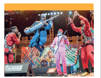
The Gnaoua and World Music Festival reinvents itself