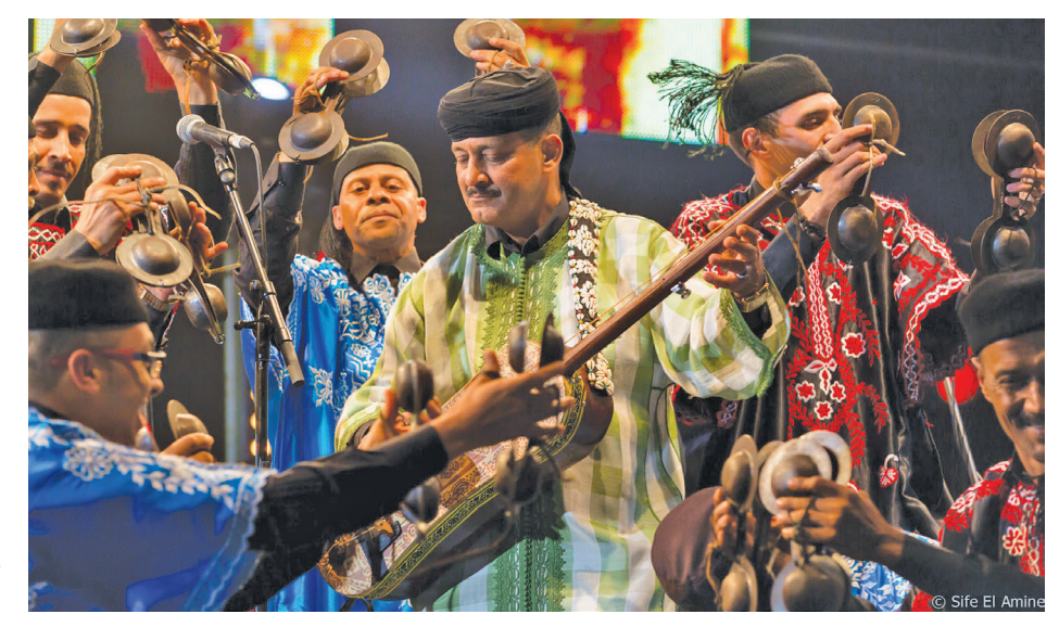
Nearly thirteen concerts of traditional Gnaoua music are scheduled, inviting the biggest names of the Tagnaouite world from each region and of the emerging maâlems from the new generation

O Gnaoua and World Music Festival this year again. After two years of absence due to the pandemic, and despite the opening of football stadiums and other sports gatherings, the authorities undoubtedly believe that music festivals still pose a threat to public health. But never mind, if you can't go to the Essaouira festival this year, well, the festival will come to you! Because far from being discouraged by such restrictions, the organizers of the mythical event have found the way out. The "Festival Gnaoua and World Music" becomes the "Gnaoua Festival Tour", while remaining faithful to its unique spirit. No less than a hundred artists, moroccan and international, for a series of unprecedented concerts in four cities of the Kingdom. To meet health constraints, concerts will be held according to the occupancy limits that will be authorized and the public reception conditions in force. The musical caravan will crisscross Morocco throughout the month of June to meet its loyal audience in Essaouira, Marrakech, Casablanca, and Rabat. Each city has its own concerts and its own programme: Twelve concerts in Essaouira, the El Menzeh square, and in Dar Souiri on June 03 and 04. Five concerts in